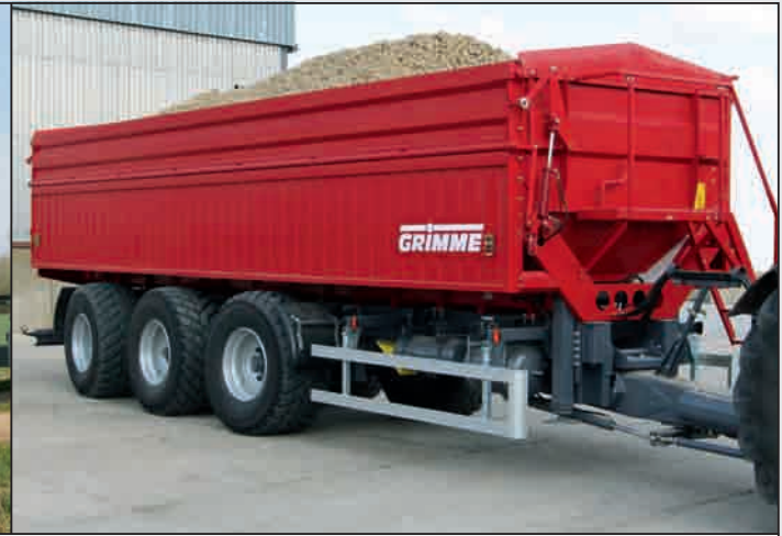
Two sizes – various transport facilities: the Multi-Trailer 190...